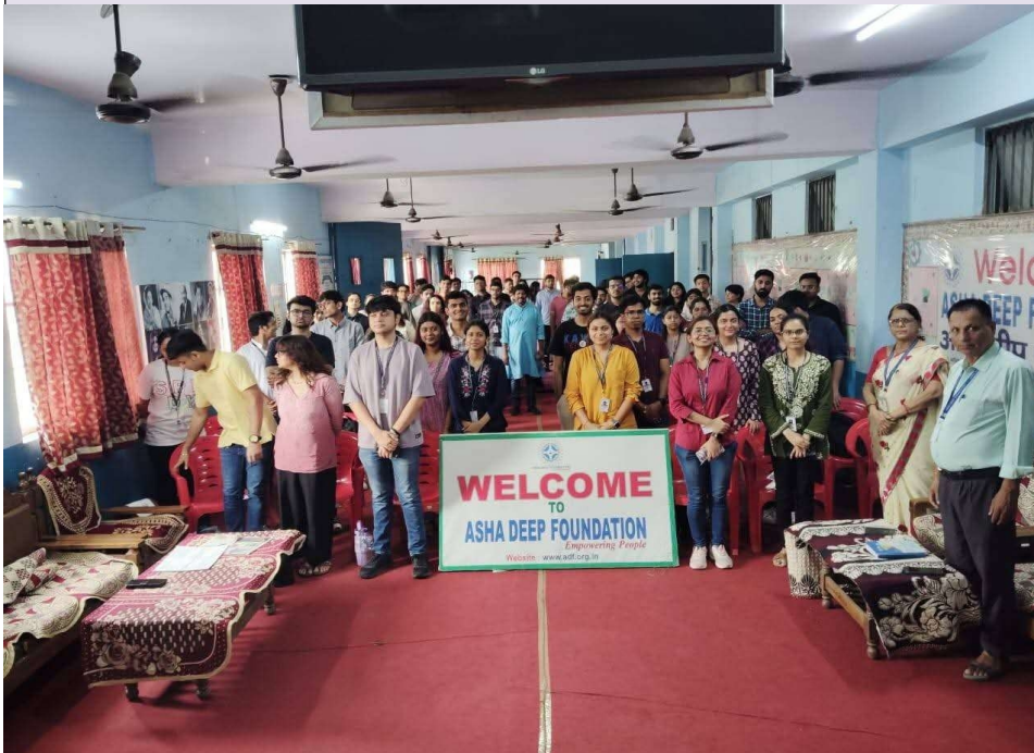
Orientation session to the interns from the Institute of Management and Technology, Ghaziabad, by the Asha Deep Foundation.