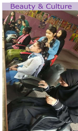
Beauty & Culture