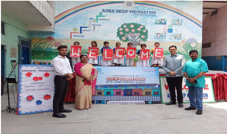
Heartfelt gratitude to SUNGROW INDIA PVT. LTD. for their generous donation of a solar power system to our school children. This impactful initiative, installing a 20kw rooftop solar plant at our St. James Convent school, Ghaziabad, significantly reducing electricity costs while fostering awareness of renewable energy among