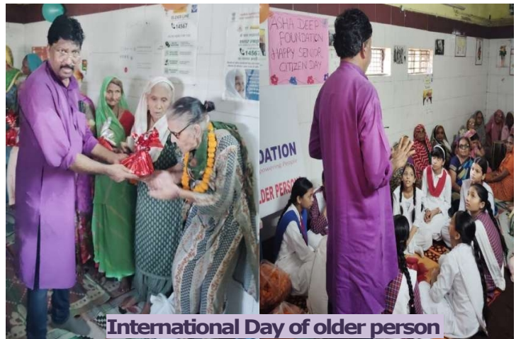
International Day of older person