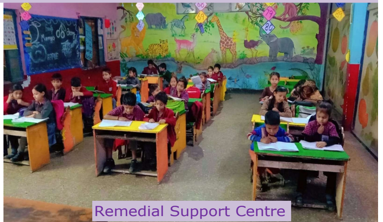
Remedial Support Centre