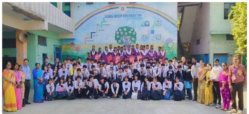
NISHIYAMATO GAKUEN JUNIOR HIGH SCHOOL , JAPAN VISITED ASHA DEEP FOUNDATION