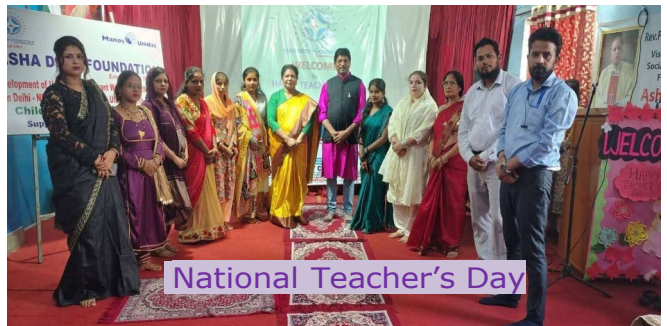
National Teacher's Day