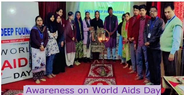
Awareness on World Aids Day