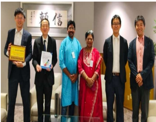
ASHA DEEP FOUNDATION DIRECTOR AND CHIEF EXECUTIVE AT NISHIYAMATO GAKUEN JUNIOR HIGH

Asha Deep Foundation's Director and Chief Executive recently undertook a significant visit to Nishiyamato Gakuen High School in Japan. This visit successfully furthered our ongoing educational and cultural exchange. Strengthening this bilateral partnership, students and faculty from both Japanese schools subsequently visited our very own St. James Convent School in Ghaziabad, fostering international goodwill and mutual learning.