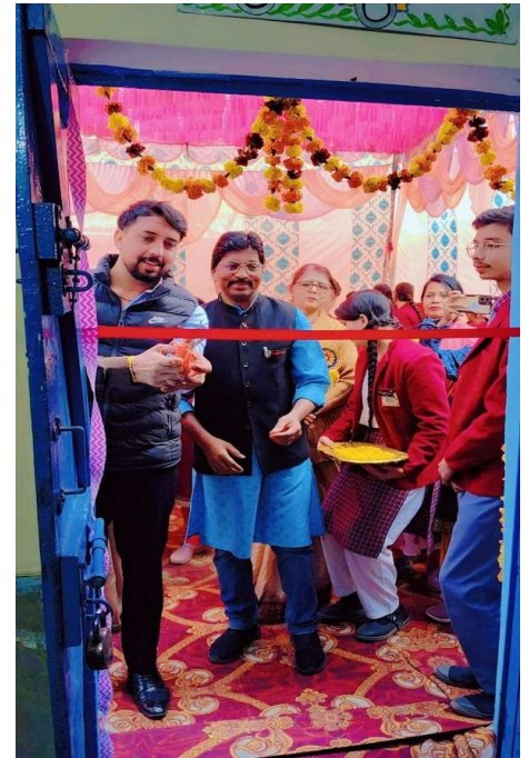
Reopening of ASHA COMMUNITY HEALTH CENTER Shaheed Nagar Ghaziabad by support of SUNGROW INDIA PVT.LTD.