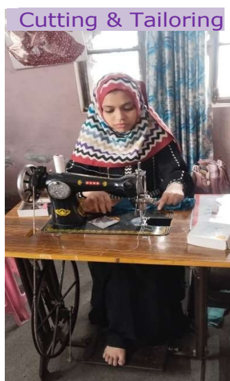
Cutting & Tailoring