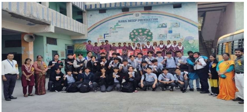
RITSUMEIKAN OSAKA HIGH SCHOOL, JAPAN VISITED ASHA DEEP FOUNDATION