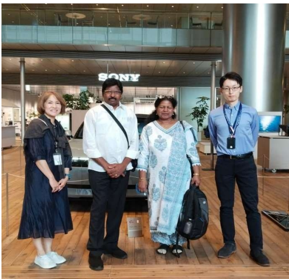
ASHA DEEP FOUNDATION DIRECTOR AND CHIEF EXECUTIVE AT JAPAN SONY