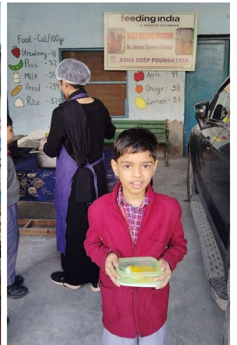
Feeding India's heartfelt support brings essential nutrition to St. James Convent School underprivileged children, nourishing bodies and minds for a brighter, healthier