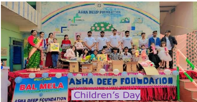
Bal Mela was a Children's day! The school buzzed with excitement as children enjoyed games, food, and laughter. It was a heartwarming celebration dedicated to our students, filled with unforgettable moments and pure joy.