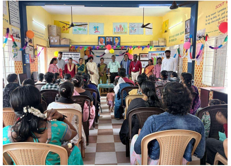
Asha Deep Foundation Yuvakendra in Kannagi Nagar, Chennai, Convocation Day, 34 diverse trainees, including Persons with Disabilities, Transgender, and Non-PWD participants, successfully completed their 3-month skill training program.