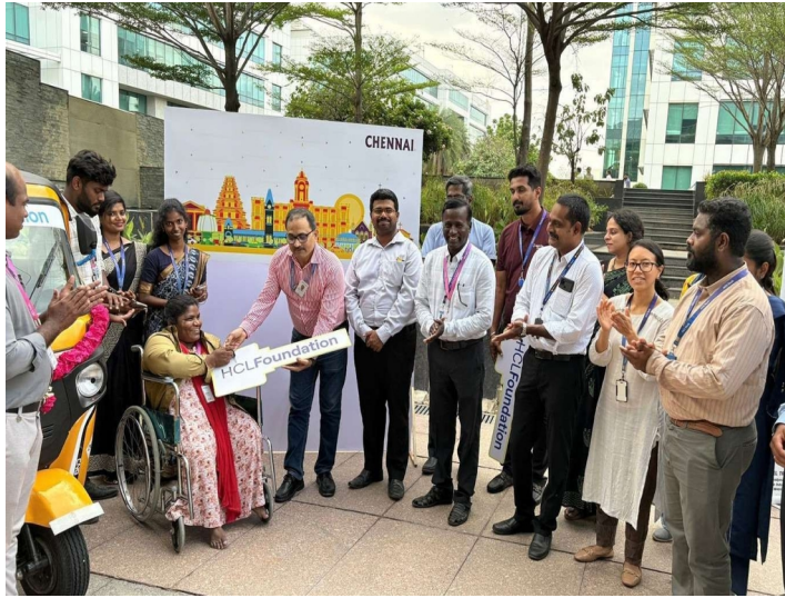
Asha Deep Foundation Yuvakendra Chennai, in collaboration with HCL Foundation, celebrated World Youth Skills Day. HCL Foundation supported Persons with Disabilities (PWDs) by providing three auto rickshaws for self-employment. Event offered our trainees valuable insight into skill-based Opportunities.