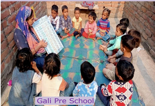
Gali Pre School